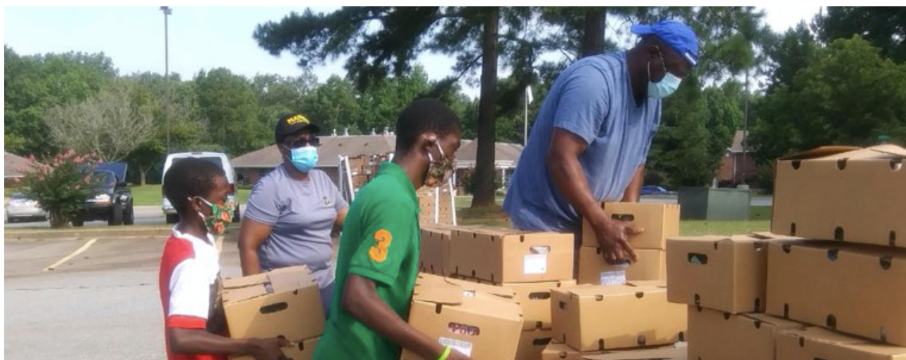
Our partnering churches at work loading fresh fruit and vegetables for community distribution.