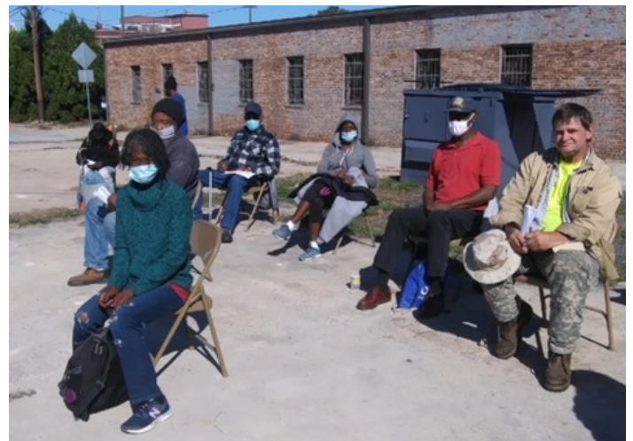
Thursday Walk in the Word at Loaves and Fishes.

Special Thanks to all who have donated their time, resources, and talents to ensure the Lord's work is accomplished through this ministry.