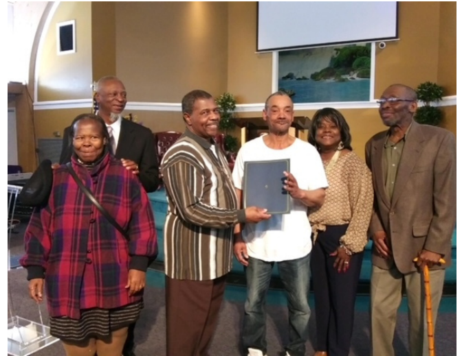
Our first baptismal candidate and our first couple married within the ministry.

Our motto is "Come-Grow-Go! Bringing Others". The ministry is not about Religion but Relationships, it is not about Coercion but an invitation for all who would like to come, it is not about Failures but Fellowship, it is not about our bondages, guilt or shame, but A Way to Freedom, it is not about False hope but An Everlasting Faith.