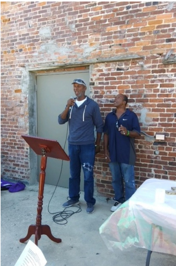
Visitors from the Brookdale Warming Center leading worship.

The Gathering Place's mission is to empower, elevate, and encourage, uplift the spirits of those who come in our presence and to give each person a reason to hope. It is said human beings can live for forty days without food, four days without water, and four minutes without air. But we cannot live for four seconds without hope. Hope is what we give through Jesus Christ.